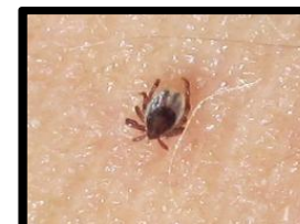
Deer tick nymph

Fever, headache, fatigue, muscle/joint aches, and rashes are common symptoms associated with TBDs. If you experience ANY of these symptoms after potential tick exposure, promptly consult a physician to discuss treatment options.