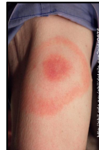
Bull's-eye Rash ( Erythema migrans )

Nymphs are often hard to detect due to their small size