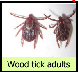
Wood tick adults