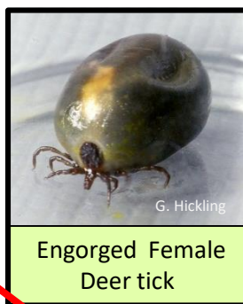
Engorged Female Deer tick