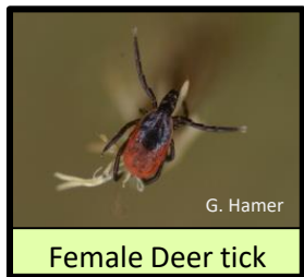
Female Deer tick

Fever, headache, fatigue, muscle/joint aches, and rashes are common symptoms associated with TBDs. If you experience ANY of these symptoms after potential tick exposure, promptly consult a physician to discuss treatment options.