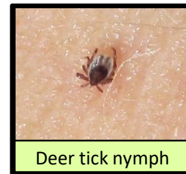
Deer tick nymph

Nymphs are often hard to detect due to their small size