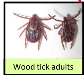
Wood tick adults