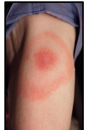
Bulls-eye Rash ( Erythema migrans )

Nymphs are often hard to detect due to their small size